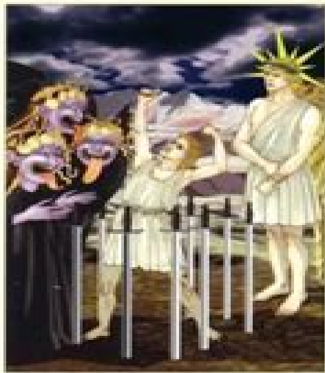
EIGHT OF SWORDS