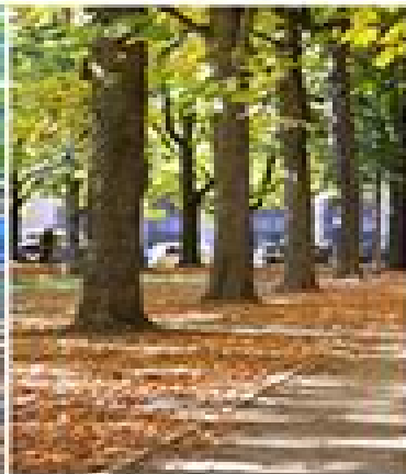
4200K WHITE FLUORESCENT