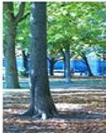
2900K TUNGSTEN LIGHT