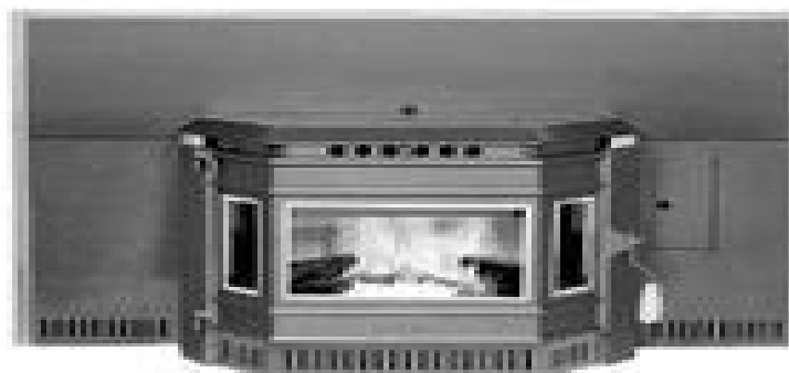
Freestanding Model Advantage B-T C INS

These appliances must be properly installed and operated in order to prevent the possibility of a house fire. Please read this entire owner's manual before installing and using your pellet stove. Failure to follow these instructions could result in property damage, bodily injury or even death. Contact your local building or fire officials to obtain a permit and information on any installation requirements and inspection requirements in your area.