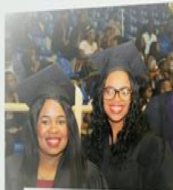
THURSDAY (16 MAY 2019) FACULTY OF COMMERCE, ADMINISTRATION AND LAW (8 am and 2 pm Sessions)