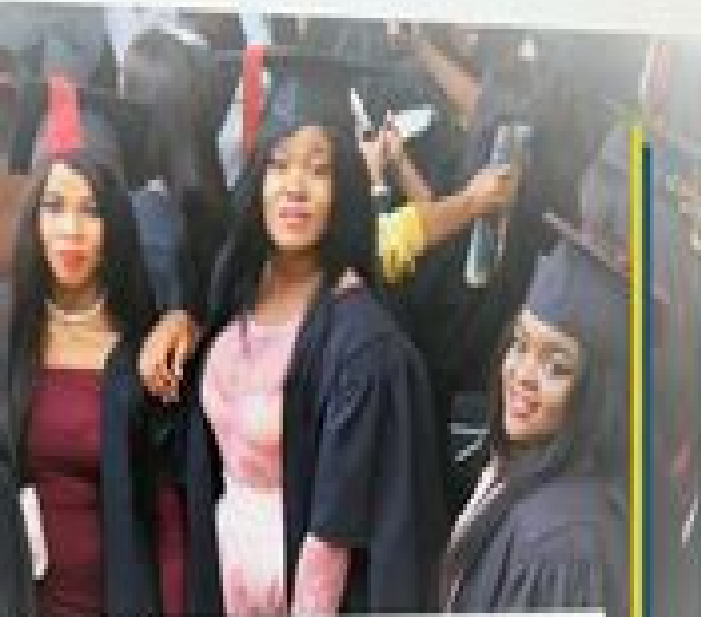
MAY 2019) SCIENCE AND AGRICULTURE (8 am sessions)