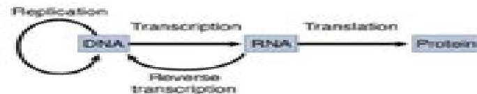
Figure 1-1-1. Central Dogma of Molecular Biology

Gene - is a unit of the DNA that encodes a particular protein or RNA molecule.