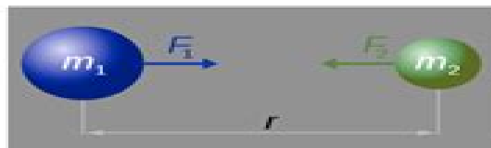
This shows a pair of forces between two masses separated by a distance r .

Every pair of objects is gravitationally attracted to each other. You are not able to attract very large objects, but sometimes you may find dust "orbiting" you.