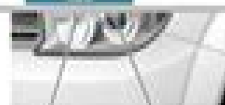
Headlight (High Beam)