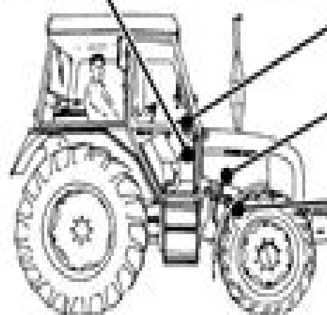
Tractor Serial Number