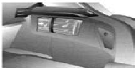
Fig. 1.249. Road kit «Limousine»

Road kit is fastened with a belt on the right side of the trunk ( Fig. 1.249 ).