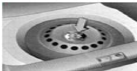
Fig. 1.251. Spare wheel

The spare wheel is located in the trunk under the hood floor. It is enshrined nut. In the model «Caravan» over the mounting nut is laying.