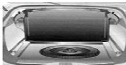
Fig. 1.252. Removing the spare wheel

The spare wheel is located in the trunk under the hood floor. It is enshrined nut. In the model «Caravan» over the mounting nut is laying.