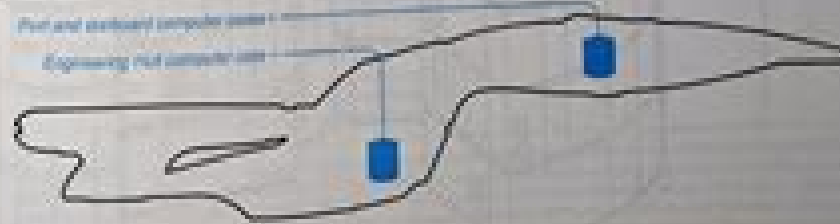
4.1.1 Location of main computer cores

Memory storage for main core usage is provided by 2,048 dedicated modules of 144 full-size optical storage chips under LCARS software control. These modules provide average dynamic access to memory at 4,000 kilobytes/sec. Total storage capacity of each module is about 600,000 kilobytes, depending on software configuration.