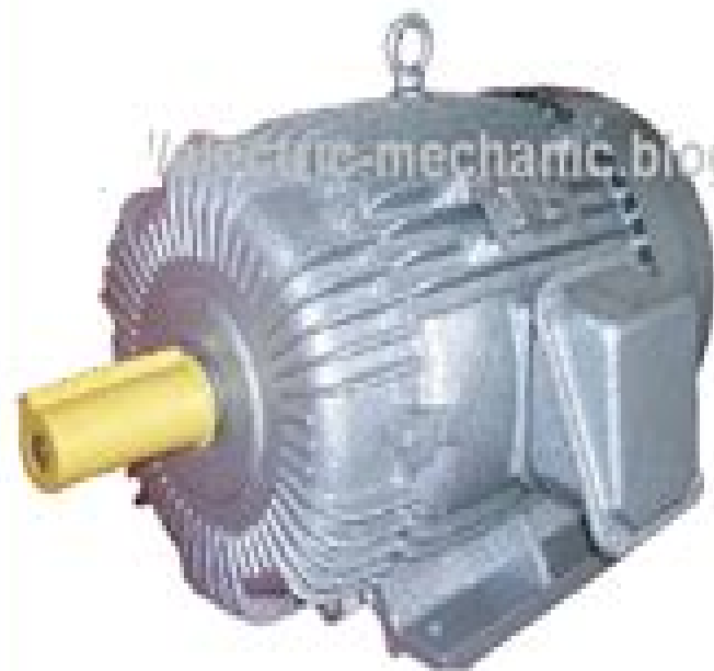
INDUCTION MOTOR 3 PHASE 380 V/15 KW