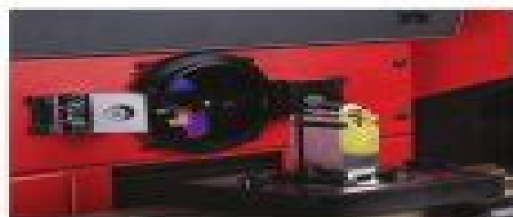
Shown 4.5x lens is now available on a standard HB400 system