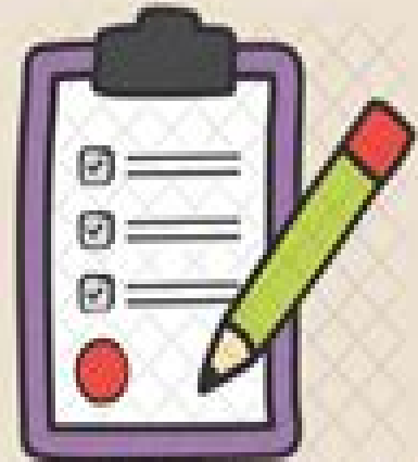
Keeping a to-do list