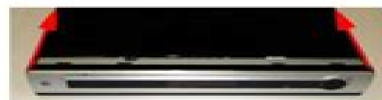
Figure 3 (above) Front View