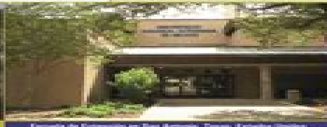
Escuela de Estudios en San Antonio, Texas, Estados Unidos