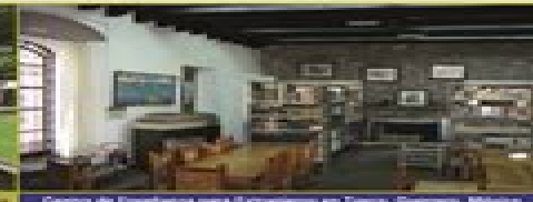
Centro de Estudios para Extranjeros en Toluca, Estado de México