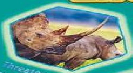
Threatened with Extinction