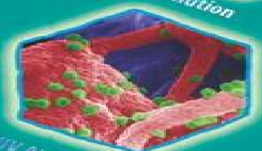
HIV Aids Virus