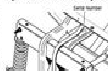
Fig. 3 Serial Number on Front Frame