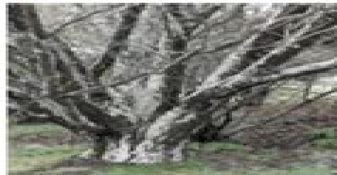
2. Light gray colored bark