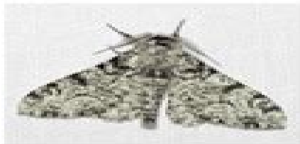
1. Light gray peppered moth

Before the year 1845, in the city of Manchester, England a population of light gray colored moths known as Peppered moths lived in the surrounding forests. They would cling to the trunks of trees that were covered with a light gray colored bark, like them.