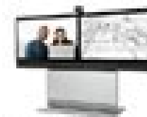
Profile 52" Dual