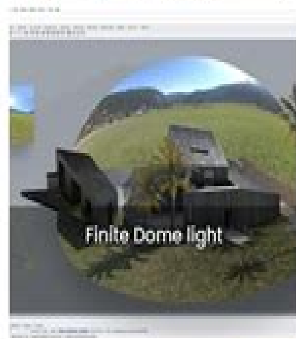
Finite Dome light