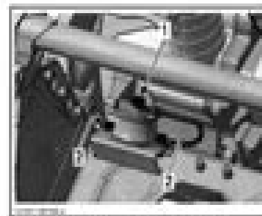
Rear view of the engine support.

1. Remove screw securing rubber mount to engine support and 2. Remove screws securing rubber mount to frame.