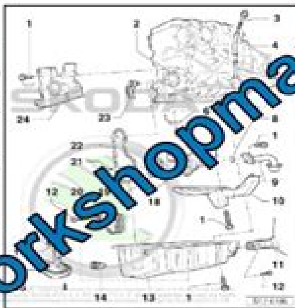
1. Removing and installing parts of the lubrication system 101