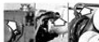
Venting valve, TAD1100C

When there is a risk of freezing the system must be drained or anti freeze should be added, see "Precautions in case of freezing" on page 5.