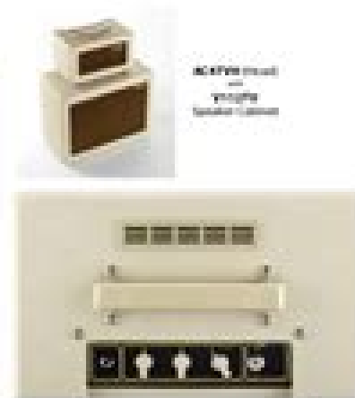
THE JOURNAL OF THE