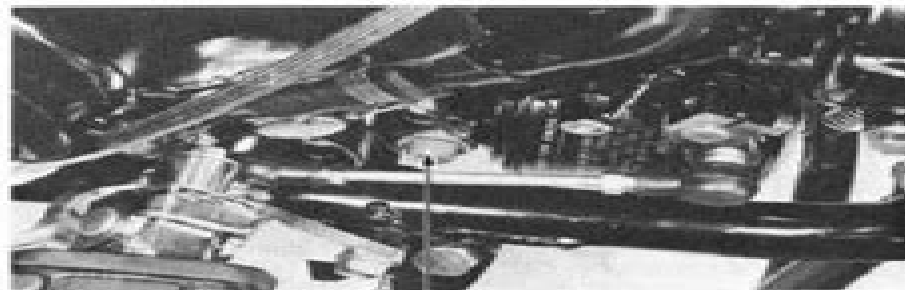
(1) OIL PRESSURE SWITCH (1) OIL PRESSURE GAUGE 07506-3000000 OIL PRESSURE GAUGE ATTACHMENT 07510-3000100