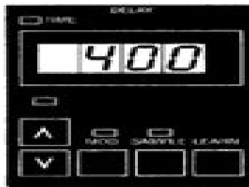
Fig.3.5.1 The Delay Section

The delaytime of preset 80 is 1023 milliseconds (1.023 seconds) and we will assume that you want to decrease this to make a shorter echo delay time, say 400 mS.