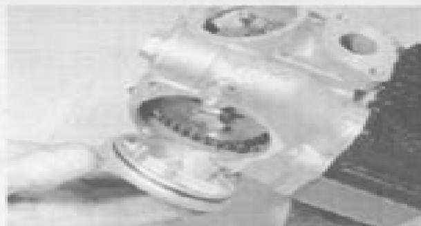
Fig. 1.8 Remove inspection cover and adjust angle back to face the cone aperture