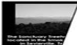
The Sanctuary Treehouse located in the Smoky Mountains National Park in Sevierville, TN.

Although going to the resort is a blast, you will not want to stay when you visit the area. The Smoky Mountains is one of America's national parks. There are lovely views with jagged mountain peaks, lush forests, and more scenic activities for couples, families, or at Sanctuary Treehouse Resort, you should take advantage of restaurants, and shows available to see. In addition, the area offers, aquariums, and much more! Visiting here might be people seek when they book a vacation!