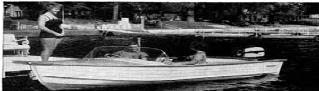
Clinker-type Aluminum Ski Champ, from $510.00