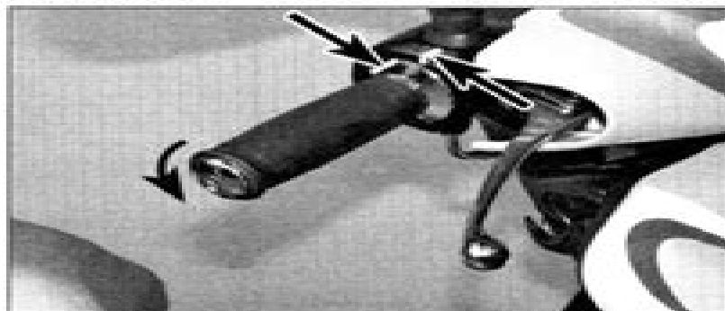
13.3 Throttle cable freeplay is measured in terms of twistgrip rotation