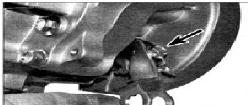
12.2 Location of the brake arm clamp bolt (arrowed)

3 It's important that there's a small amount of freeplay in the throttle cable. This is either measured as twistgrip rotation (typically between 2 to 5 mm) (see illustration), or as