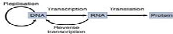
Figure I-1-1. Central Dogma of Molecular Biology

Gene - is a unit of the DNA that encodes a particular protein or RNA molecule.