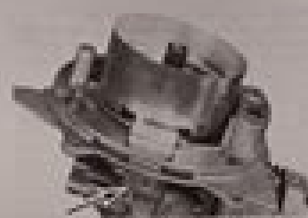
Figure 13 Correct Actuator Arm Location

STEP 45 Install the Actuator Bearing & Retainer Assembly and the Brake Plate.