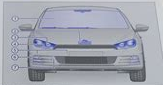
Fig. 2 Overview of the front of the vehicle