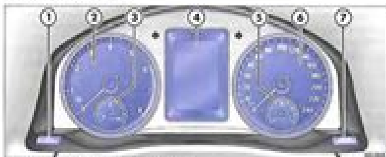
Abb. 8: Beispiel: Instrumente in der Testungsumgebung

Lesen und beachten Sie zuerst die wichtigsten Informationen und Sicherheitshinweise auf Seite 6.