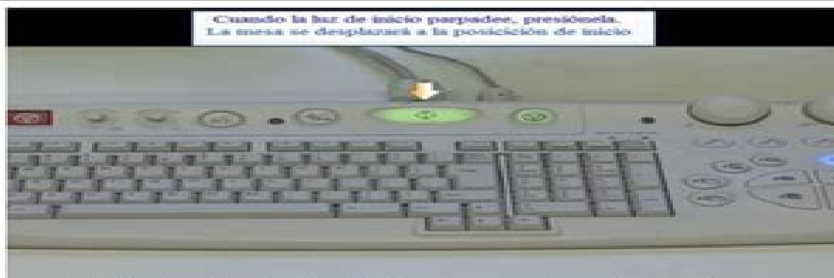
Figura 15-10). Cuando el botón de Start Scan se enciende indica que la programación ha sido correcta. El Técnico lo aprieta y comienza la adquisición. Aquilion 64 (HUMS).