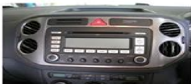
Old RCD 500