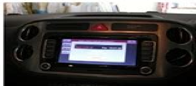
New RNS 510