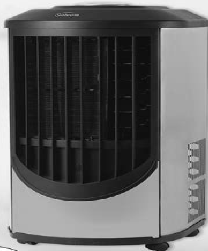
Model #KY-25/Y: 9000 BTU PORTABLE DIGITAL AIR CONDITIONER STAINLESS STEEL ACIER INOXYDABLE ACERO INOXIDABLE