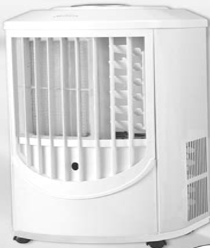
Model #KY-25/Y: 9000 BTU PORTABLE DIGITAL AIR CONDITIONER WHITE METAL METAL BLANC METAL BLANCO