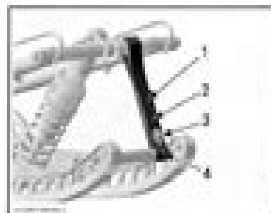
Function Test (used) Function Program, memory testing Function

NOTE: Decreasing the stopper strap length may reduce comfort. If too much weight transfer is felt, try to correct it by adjusting the coupling blocks first. Always install stopper strap full as close as possible to the lower staff.