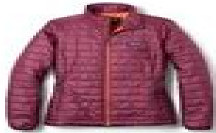
MID WEIGHT LAYER