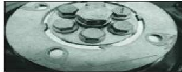
Fig. 50 Triggered driveGUARD element