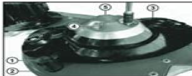
Fig. 49 Stop pin in stone guard disc