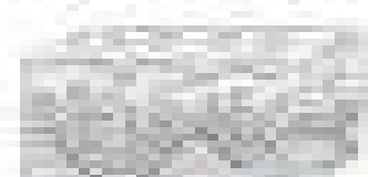
Simple Squamous Epithelium

Identify each type of epithelial tissue and its function. (You may use the following as a guide.)