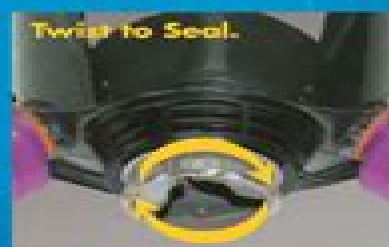
Twist to Seal.