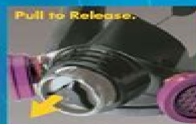
Pull to Release.