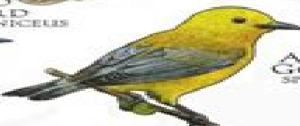
PROTHONOTARY WARBLER PROTONOTARIA CITREA