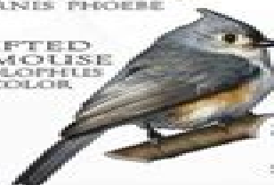
TUFTED TITMOUSE PAEOLOPHUS NICOLOR