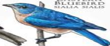
EASTERN BLUEBIRD STALIA STALIS