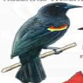
RED- WINGED BLACKBIRD AGELAIUS PHOENICEUS