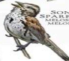
SONG SPARROW MELOSPIZA MELODIA