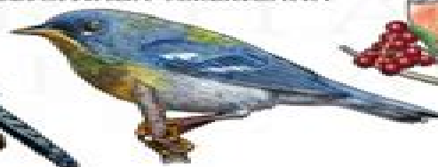
NORTHERN PARULA SETOPHAGA AMERICANA