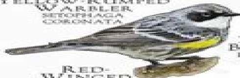
YELLOW-RUMPED WARBLER SETOPHAGA CORONATA