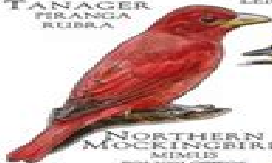
SUMMER TANAGER PIRANGA RUBRA