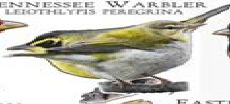
TENNESSEE WARBLER LEIOTHLYPTIS PEREGRINA