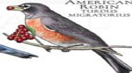
AMERICAN ROBIN TURDUS MIGRATORIUS