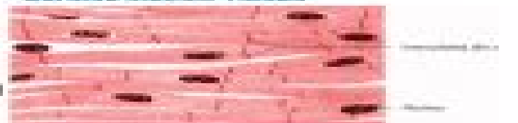
Image courtesy of OpenStax under a CC BY 4.0 International license.