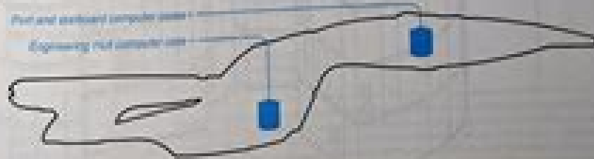
4.1.1 Location of main computer cores