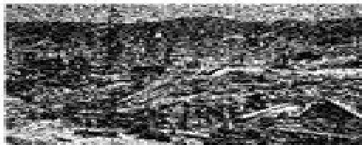
Destruction of Hiroshima, 1945