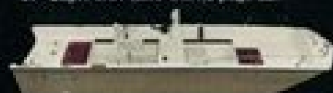
17' Capri Sport, page 22.