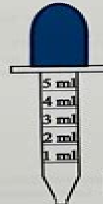
D. Oral Dropper

Answer the following questions 92 through 95 referring to the above devices.