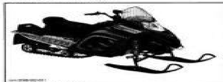
TYPICAL — RF SERIES

This shop manual covers the following BRP made 2007 RF Series models: