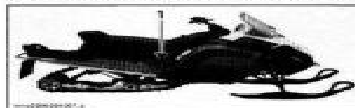
TYPICAL 1. Vehicle identification number